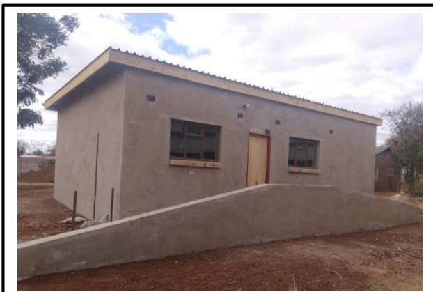
This is our Care Cottage where children needing extra care after operations will be able to stay with a caregiver until they are able to go home. Thanks to the donors who made this facility possible. Hopefully we will be able to complete this soon.

After many bureaucratic hurdles we managed to get our Helpline up and running. We are advertising this through social media and are already getting calls coming in. This is so crucial in these more than tough times.